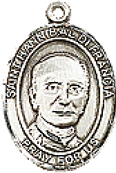
8327 7/8" tall