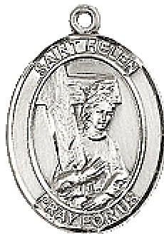
7043 1 1/4" tall

Also known as Saint Helena, she converted to Christianity later in life. Her husband divorced her to pursue a political relationship, and she was left to care for her son, Constantine the Great, who would later legalize Christianity. She devoted herself to the Faith and became the patroness of archaeologists because she unearthed the True Cross.