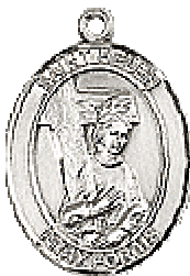
8043 7/8" tall