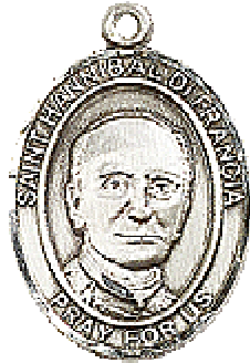
7327 1 1/4" tall